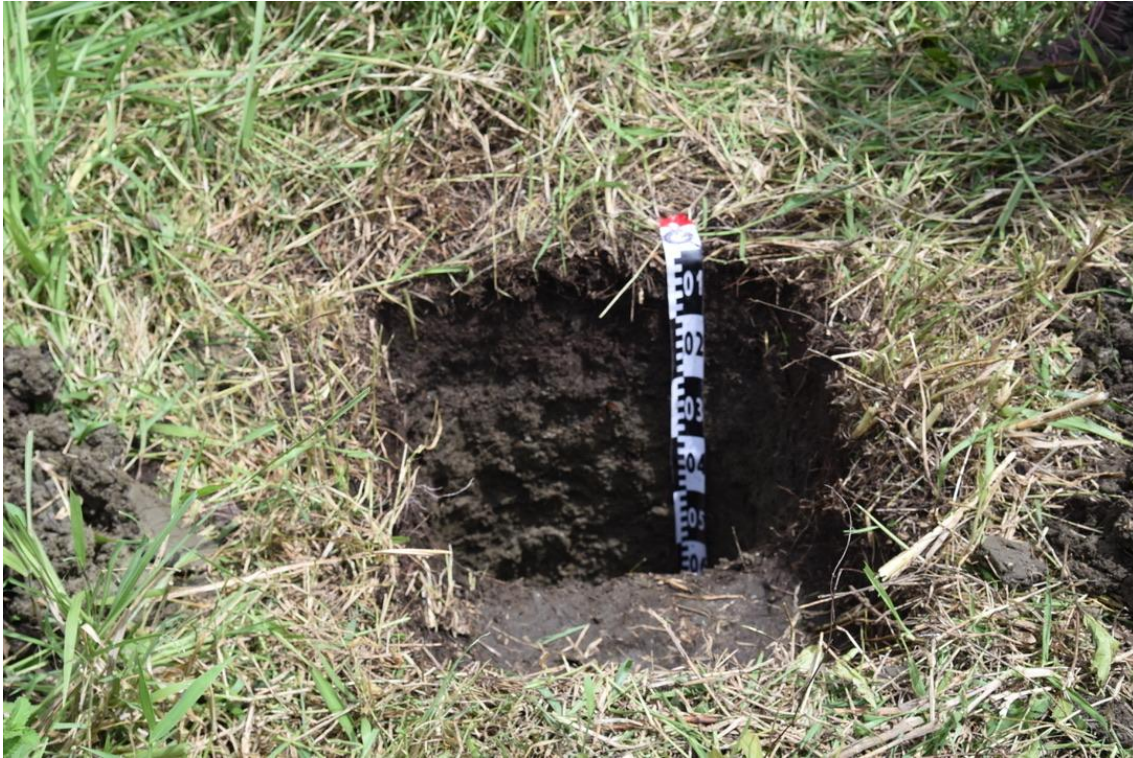
Soil profile at the wetlands of Budsilhá.