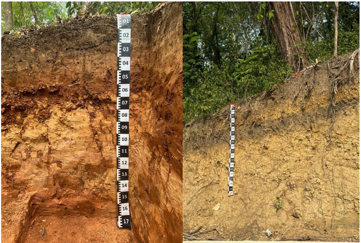
Tren Maya hotel Profiles.

February 25. High river terrace profile. Transfer to Villahermosa. End of the excursion at the hotel La Venta Inn (this accommodation is not included in the registration fee).