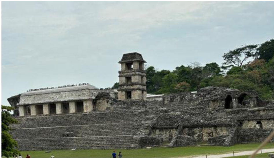
Palenque archaeological site.

Palenque, Mexico, February 19 – February 25, 2026