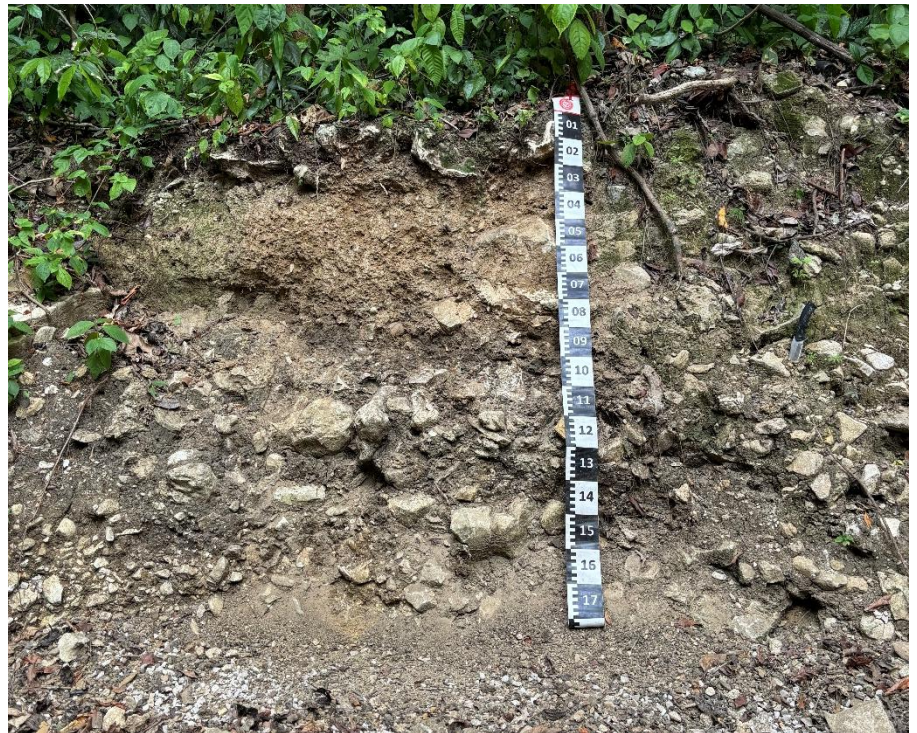
Travertines of Palenque. Soil profile at the entrance of Palenque archaeological site.

During the field excursion, visits to the following sites are planned: